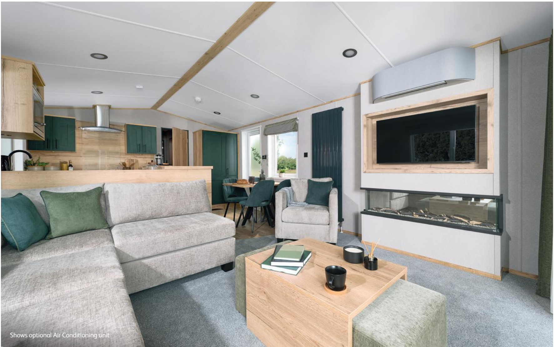
Shows optional Air Conditioning unit