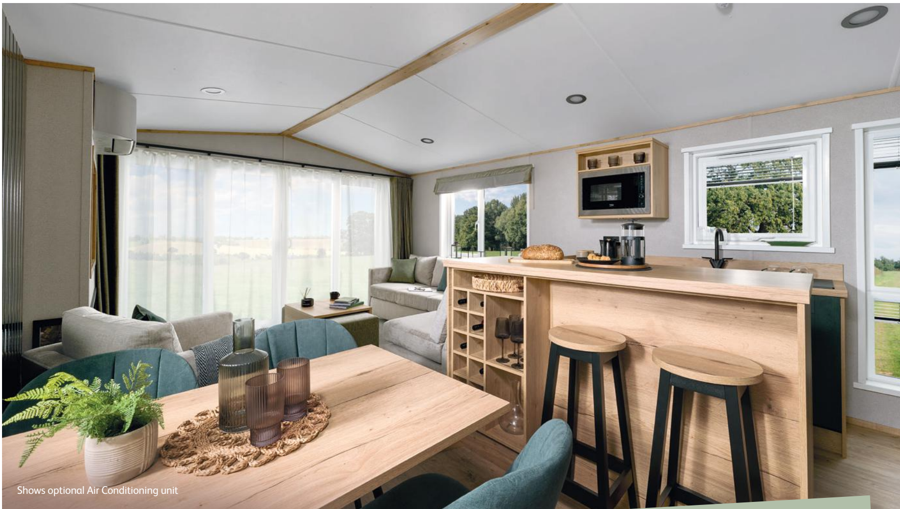
Shows optional Air Conditioning unit